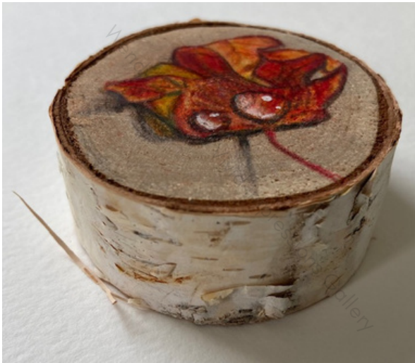
Crumpled Orange Leaf

Through exploring the interplay of shadow, light, color, and reflection on recycled birch wood rounds, I aim to capture the essence of imperfection and uniqueness in nature. Explore this artistic journey as I explore the vivid impressions of leaves and water droplets. These works were completed using colored pencils and white gel pen on birch wood rounds. The effect of shadow and light hope to engage the mind in perceiving the transient beauty of the real leaf in a more longform piece. The beautiful birch tree's parts create a loving pedestal for nature's beauty captured here.