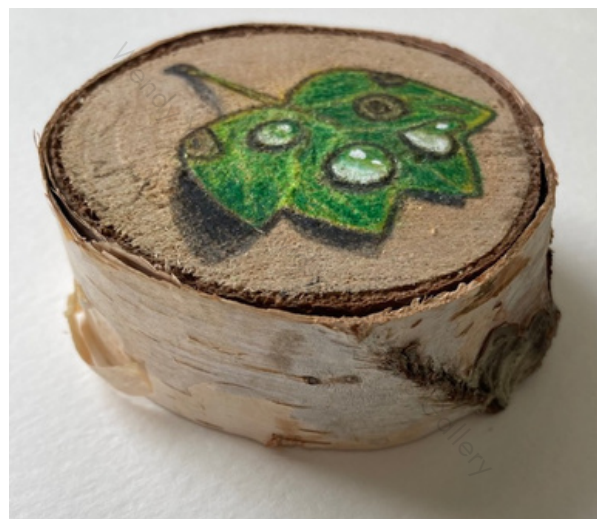
Tiny Green Tulip Leaf