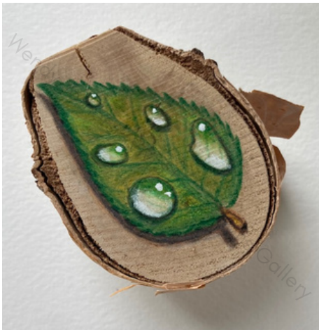
First Leaf Study Diameter 7 cm or 3 in Height 3 cm under 1 in

Step into a world where nature's quiet beauty is rendered with care and precision. This collection features hand-drawn works created with colored pencils on birch wood rounds, each piece celebrating the textures, shadows, and vibrant hues found in the natural world. I strive to honor the imperfect perfection of leaves, light, and organic forms—capturing what's often overlooked with realism and reverence. Every artwork is crafted entirely by hand.