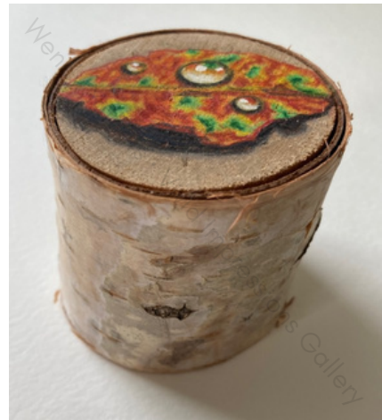
Multicolored Leaf Fall Diameter 5.5 cm or 2 in Height 5 cm under 2 in