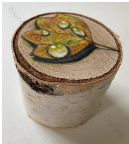
Tiny Tulip Tree Leaf Diameter 6 cm or 2.5 in Height 5.5 cm under 2 in