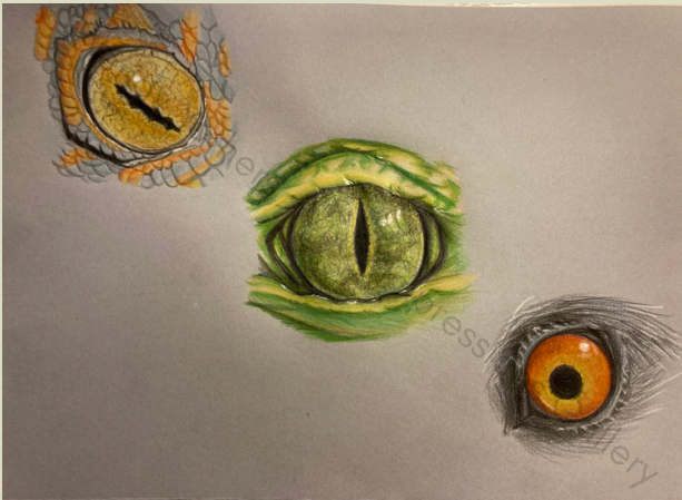
The Eyes have it Oct 2025 One of my first adventures into working with colored pencils to explore realism.